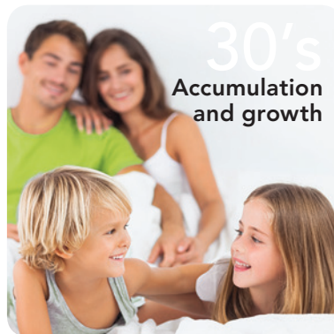
30's Accumulation and growth