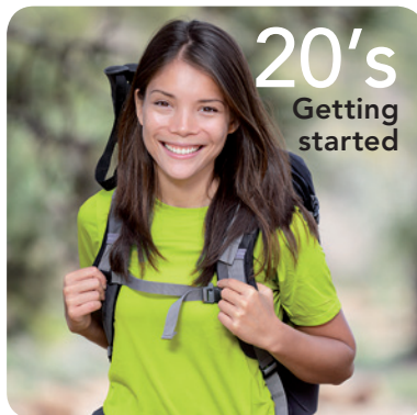
20's Getting started

Your adviser may be a specialist in one area of advice, such as personal insurance, or provide service across a broad range of advice needs. To find out more about your adviser's areas of specialisation refer to their Adviser Profile attached.